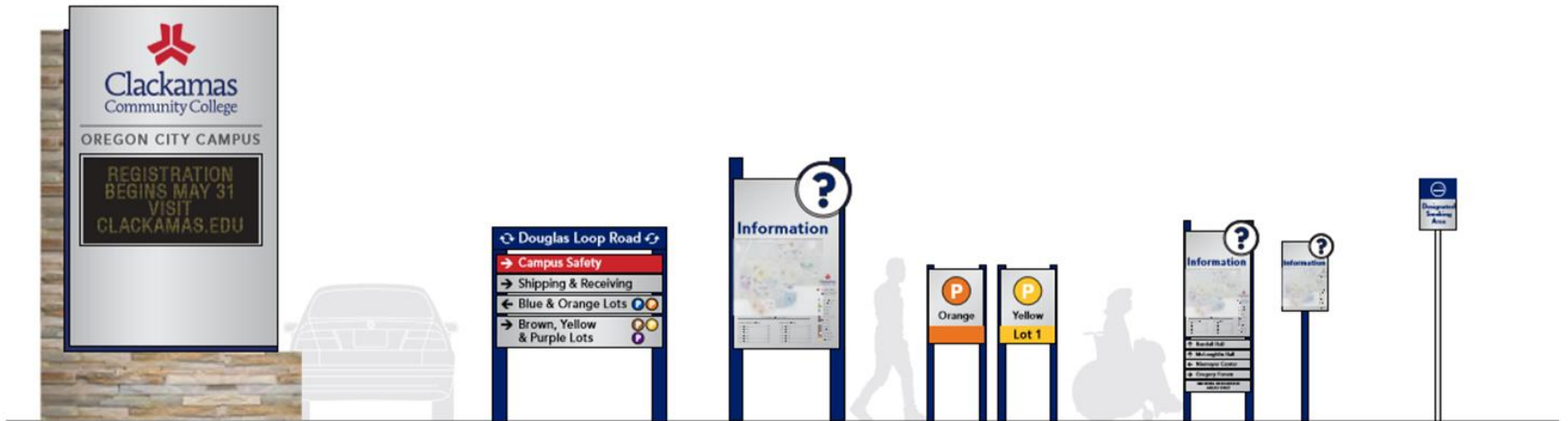
Oregon City Campus

Note: Exact design to be selected from options shown in this document.